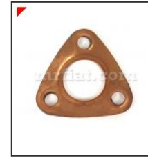
Topolino Copper Exhaust... EX-600-005-1

Copper exhaust gasket for Fiat Topolino models. Fiat part # 976075 Part #: EX-600-005