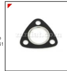
Topolino Exhaust Gasket EX-600-004

Exhaust gasket for all Fiat Topolino models. Fiat part # 976075 Part #: EX-600-004