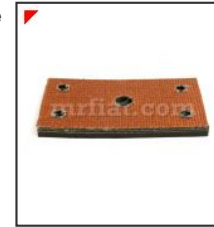
Topolino A/B/C Muffler Rubber EX-T500-003

Muffler rubber for Topolino A, B, and C models. Part #: EX-T500-003