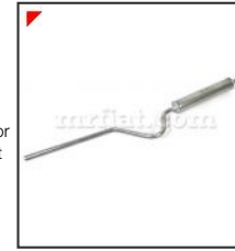
Topolino B/C Rear Muffler EX-T500-001

Rear muffler for all Topolino B and C models.