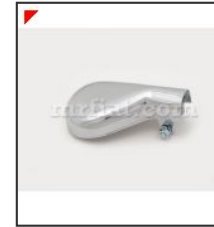
Topolino Chrome Muffler Tip EX-T500-002

Chrome muffler tip for all topolino models.