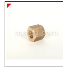
Topolino Muffler Nut EX-500-030-1

Muffler nut for all Topolino models. Fiat part # 830561 - 747144 - 4261250 - 7706042. Part...