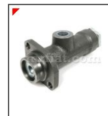
Topolino B/C Master Brake... BR-T500-001-1

Master brake cylinder for all Fiat 500 Topolino B and C models. 25.4 mm bore / 12 x 1.25.