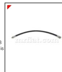
Topolino Brake Hose 433mm M10... BR-T500-004