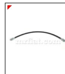
Topolino B/C Brake Hose 543 mm... BR-T500-003

Brake hose for Topolino B and C models. This hose is 543mm in length with 2 x M17 threads.