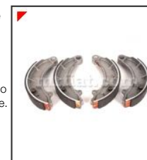
Topolino Brake Shoes Set BR-T500-008

Set of brake shoes for all Topolino models. Part #: BR-T500-008