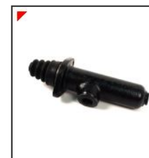
Topolino A Master Brake... BR-T500-005

Master cylinder for Topolino A models. 19.5 mm bore. Part: BR-T500-005