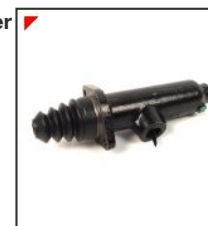
Topolino A Master Brake... BR-T500-006

Master cylinder for Topolino A models. 22.22 mm bore. Part: BR-T500-006