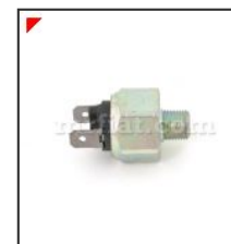
Topolino B/C Brake Light... BR-T500-009

Brake light switch for Topolino B and C models. Part #: BR-T500-009