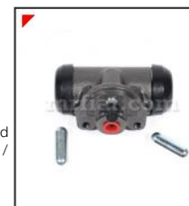
Topolino C Brake Cylinder BR-T500-002