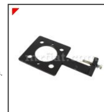
Topolino Brake Adjustment Tool BR-T500-010

Brake adjustment tool for Topolino models. Part #: BR-T500-010