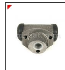
Topolino A Brake Cylinder... BR-T500-007

Brake cylinder for Topolino A models. 19.05 mm bore. Part: BR-T500-007