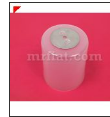
Tourist Scooter White...

We receive excellent service from Fedex and the USPS, although occasionally a mishap occurs. Open any damaged packages in the presence of the carrier, and call us immediately so we can file a claim. If a package arrived damaged all packaging materials must be kept and may be collected and inspected by the carrier when investigating a claim. Missing packages must be reported to Italian Auto Parts, Inc in a timely manner to enable us to file a claim with the carrier. On any orders shipped by truck freight, signing for a shipment constitutes an acknowledgement that the order has been received in good condition; Italian Auto Parts, Inc cannot be held responsible for damage once a truck freight package has been signed for.