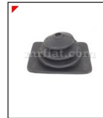
Bianchina Transformabile 2nd... IN-A500-012

2nd series gear shift boot for Bianchina Transformabile models.