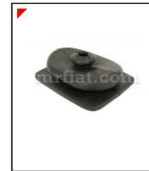
Bianchina Transformabile 1st... IN-A500-011

1st series gear shift boot for Bianchina Transformabile models.