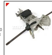
500 F/L Synchronized... TM-500-100