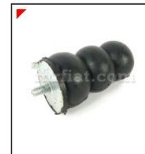
126 Swing Arm Axle Rubber... TM-OTH-044

Swing arm axle rubber stop for Fiat 126 models. Part #: TM-OTH-044