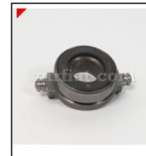
500 N/D Clutch Bearing TM-500-024

Clutch bearing for Fiat 500 N and D models. Fiat part # 4151164.