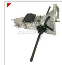
500 5 Speed Transmission TM-500-102

5 speed transmission for Fiat 500 models. Part: TM-500-102