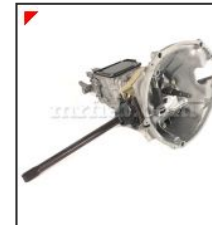
500 Giardiniera Bianchina... TM-500-103

Transmission for Fiat 500 Giardiniera and Bianchina Panoramica models. Part #: TM-500-103